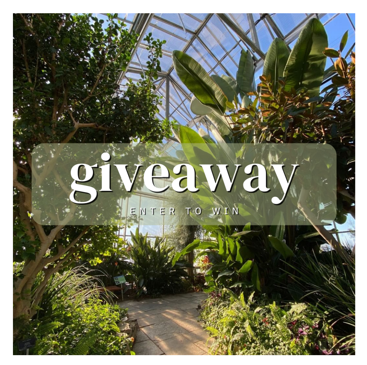
Here at RAHB, we love the local businesses in our jurisdictions and want to support and celebrate them in anyway we can!

For every month of 2022, we will be featuring a "local love" contest that offers our followers to win a gift card to our local business pick of the month. For the month of May, we're picking our favourite way to spend a spring day which is visiting the gardens at @rbgcanada - For eight decades, Royal Botanical Gardens (RBG) has connected people to the plant world. The RBG is the largest botanical garden in Canada, a National Historic Site, and registered charitable organization with a mandate to bring together people, plants and nature.